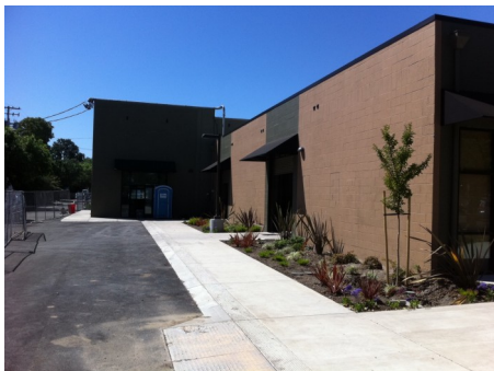
Outside, near parking lot

Our Grand Opening will take place in September (actual date TBA). We hope to see you there!